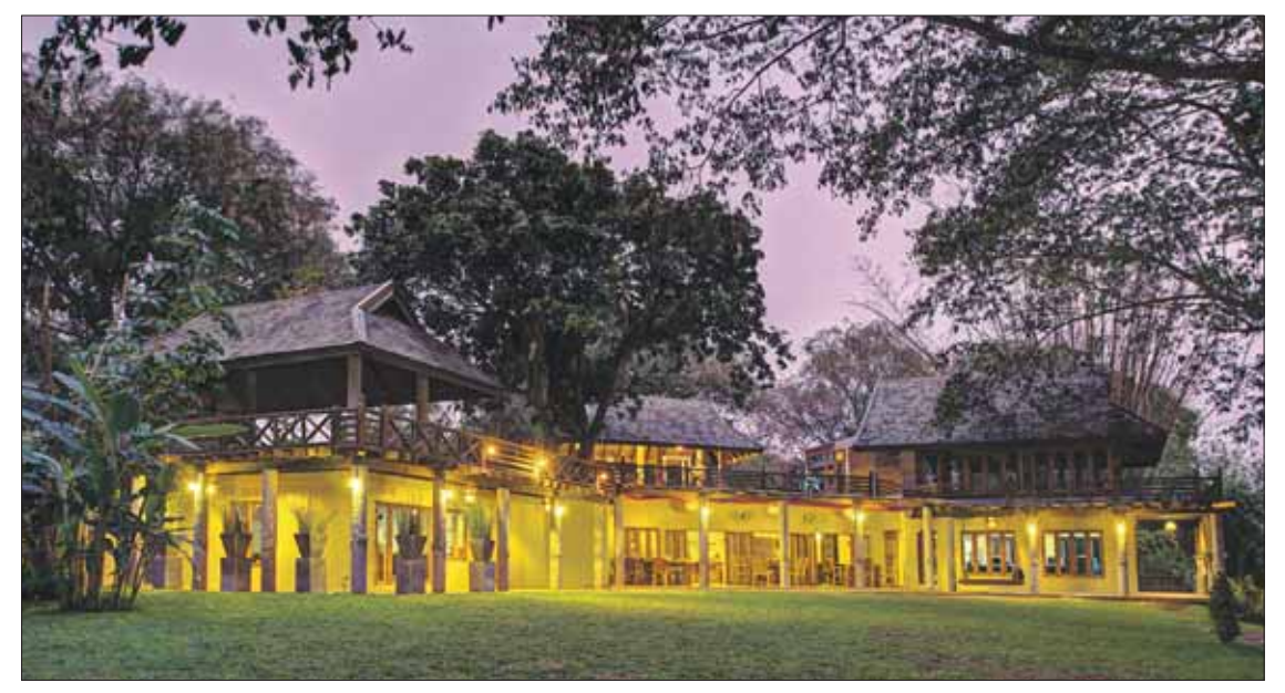
Cry for help: Over four years of operation The Cabin, an upmarket treatment facility near Chiang Mai, has witnessed a huge increase in the number of Australian mining workers seeking rehabilitation.