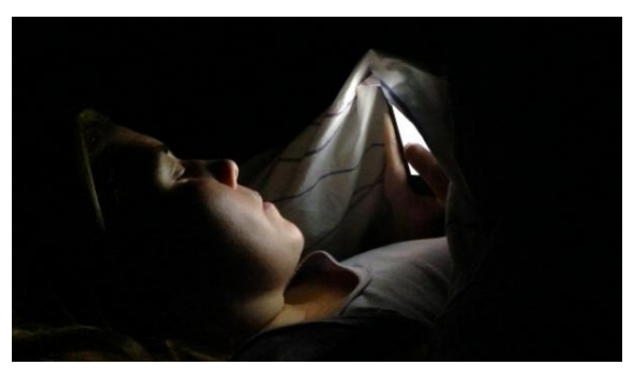
Our addiction to the small screen is messing with our minds. In the process, it's creating a new set of mental problems that have health specialists worried.